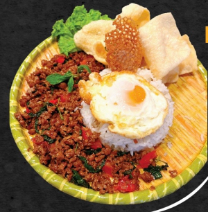
L5 DE SIGNATURE THAI MINCE PORK RICE DE 泰式猪肉碎便当 RM12.90