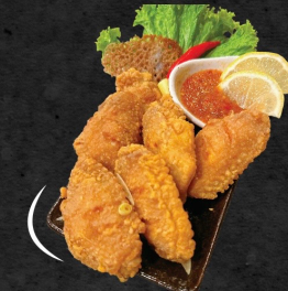
L6 LEMONGRASS CHICKEN WINGS (6PCS) 炸香茅鸡翅膀 RM8.90