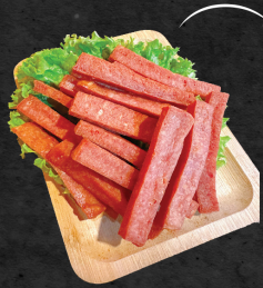
SN1 LUNCHEON MEAT FRIES 香炸午餐肉条 RM12.90

Brunch 早午餐 11AM-2PM, Happy Hour 欢乐时光 3PM-10:30PM