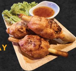
SN4 LEMONGRASS CHICKEN SATAY 香茅鸡肉卷 RM12.90