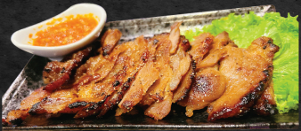
SN2 MARINATED THAI PORK 泰式猪颈肉 RM19.90