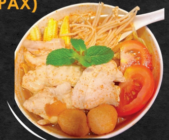
L4 CHICKEN TOMYUM CREAMY SOUP W RICE (1PAX) 鸡肉泰式冬荫便当 RM9.90