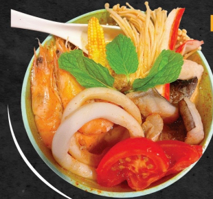
L3 SEAFOOD TOMYUM CREAMY SOUP W RICE (1PAX) 海鲜泰式冬荫便当 RM12.90