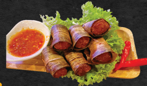
SN8 THAI PANDAN CHICKEN 泰式香叶鸡 RM12.90