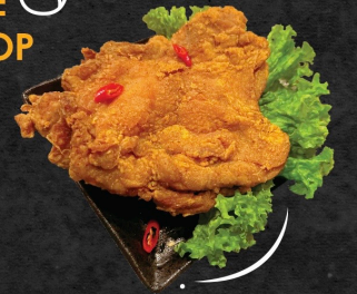
L7 DE SIGNATURE CHICKEN CHOP DE 招牌炸鸡排 RM8.90

All picture shown are for illustration purpose only. TAKE AWAY/PICK UP : Add On RM1.00 For Lunch Box with Rice. DINE IN : All prices shown above are subject to 5% service charge.