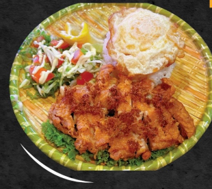
L1 DE SIGNATURE CHICKEN CHOP RICE DE 招牌炸鸡排便当 RM10.90