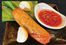
SN6 THAI GARLIC SAUSAGE (2pcs) 泰式蒜香肠 RM12.90