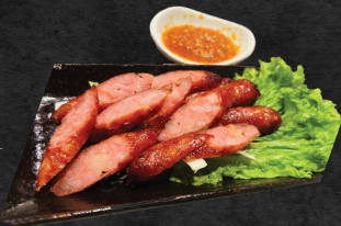
SN7 FRIED LONG FARM SAUSAGE 爆香农庄香肠 RM12.90

All picture shown are for illustration purpose only. DINE IN : All prices shown above are subject to 5% service charge. 堂食: 以上食品价钱需添加服务费5%