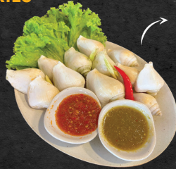
SN3 SIPUT GONGGONG 东风螺 RM19.90