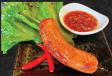
SN5 THAI SPICY SAUSAGE (2pcs) 泰式香辣肠 RM12.90